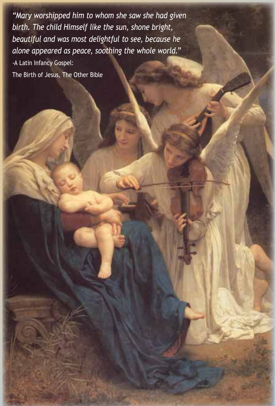
Song of the Angels by William-Adolphe Bouguereau